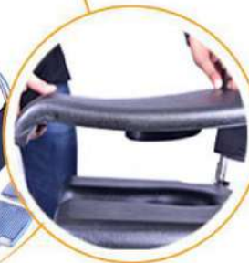
4A. Top Seat Cover

Can be used as a regular wheelchair with the top seat cover