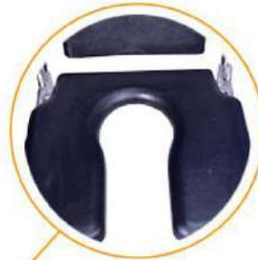
3. Front seat cutout for easy hygiene access