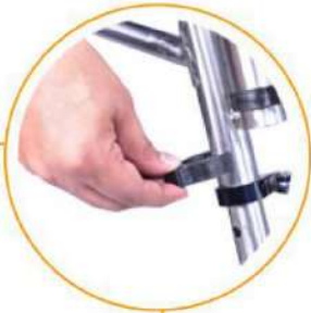
2. Tool free height adjustability