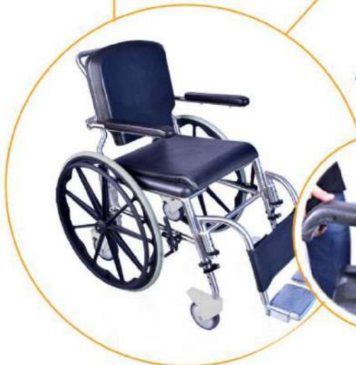
4B. Chair with top seat cover*